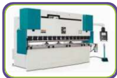
CNC Hydraulic Press Brake - EHP Series