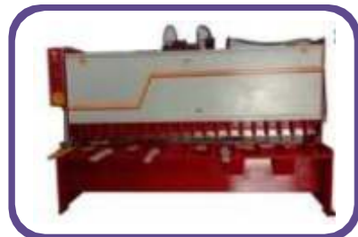
Hydraulic Shear Machine