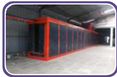
Electrostatic Powder Coating Machine