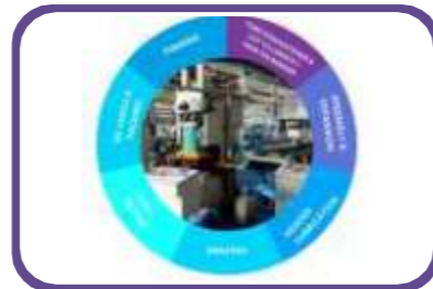
Heat Exchanger System