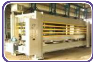
Sandwich Panels Foaming Press