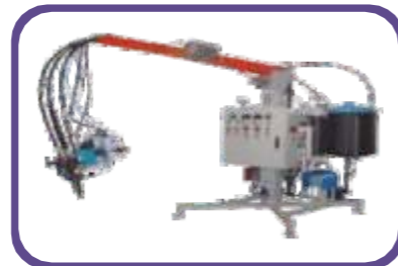
Puf Inject Machine